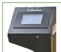
Digital Command Center with Preprogrammed Options