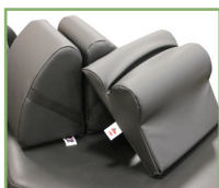
Knee & Cervical Bolster Set